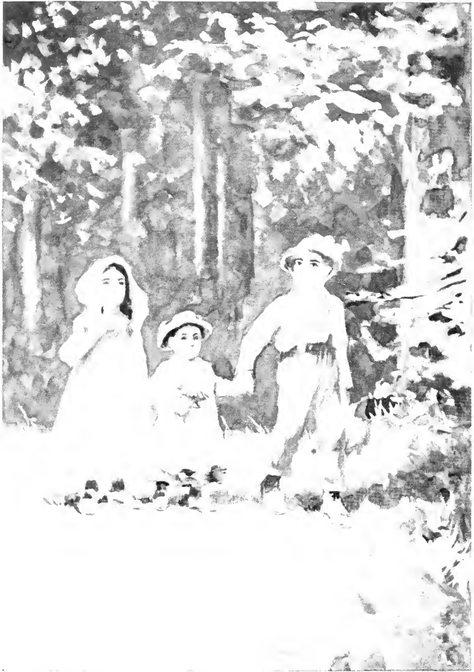
THE CHILDREN WENT INTO THE WOODS TO GATHER STRAWBERRIES